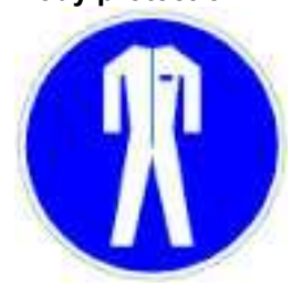
Protective work clothing.